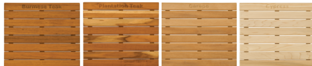
Burmese Teak Plantation Teak Garapa Cypress