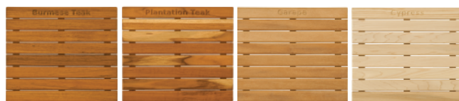
Burmese Teak Plantation Teak Garapa Cypress