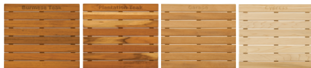
Burmese Teak Plantation Teak Garapa Cypress