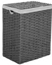
A. Laundry Hamper (1pc)