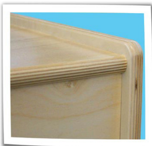
Typical Recessed Plywood Backs