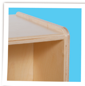
Typical Corners & Edges