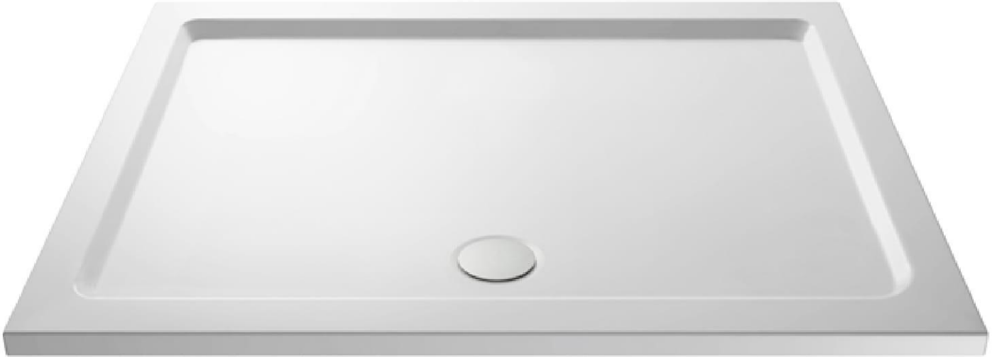
1400 x 700 RECTANGULAR TRAY

DESCRIPTION: Rectangular Tray 1400X700x40