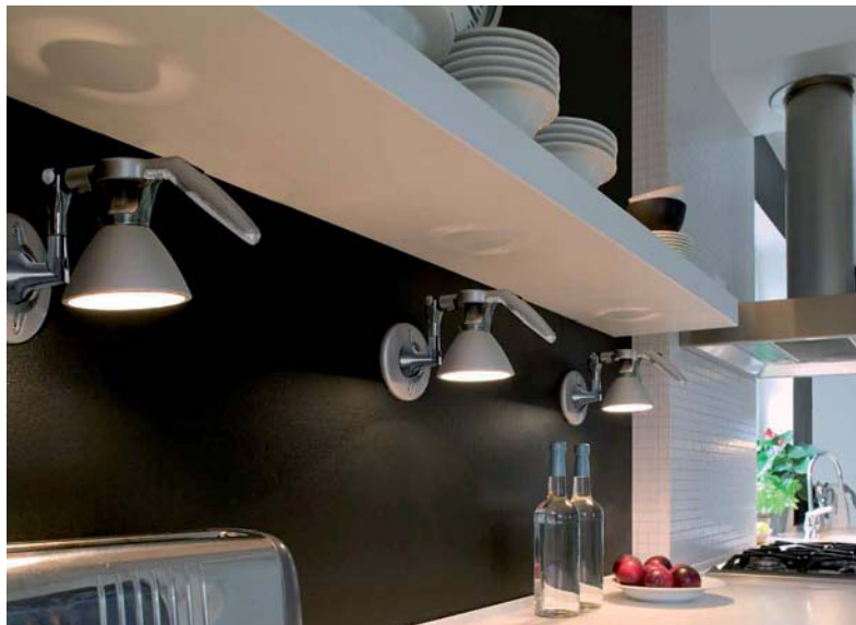
D33N/3 universal joint