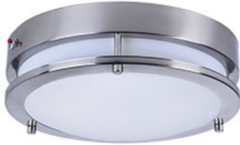
Linear LED Flush Mount