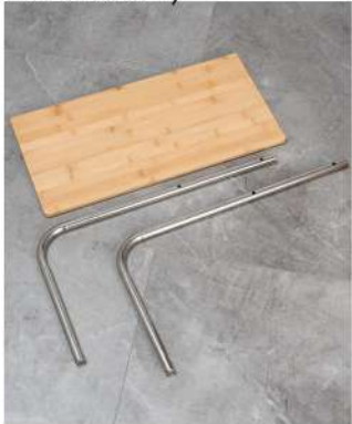
13. Remove bracket laminate and bracket