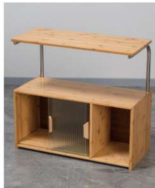
18. Turn the cabinet over (as shown)