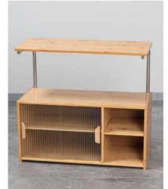
24. Installation completed