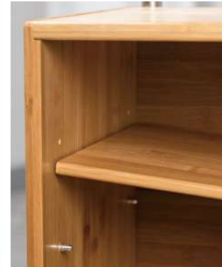
20. Place the large center laminate from step 9 on the plug