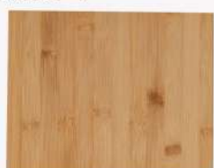
Middle small laminate*1