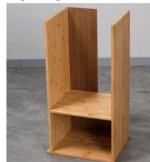
7. Insert the long backplane along the grooves between the laminates