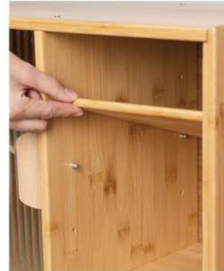
22. Place the middle small laminate ply on the plug