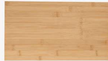
Middle large laminate*1