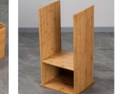
6. Turn the cabinet over (as shown)