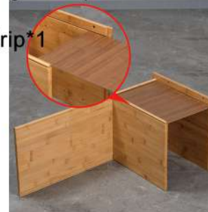
4. Insert the short backplane along the groove