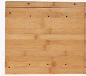
Right side panel*1