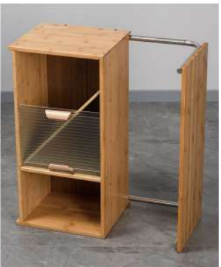
17. Bracket installation completed