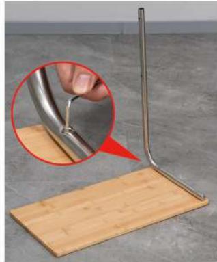
14. Install the left bracket with tip screws