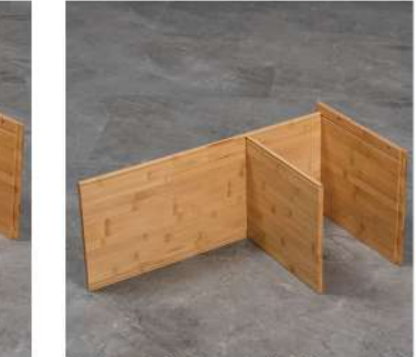
3. Install the middle partition with long screws