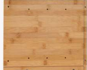
Left side panel*1