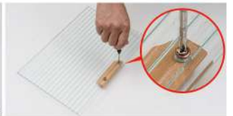
Tighten the handle screws