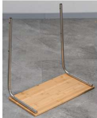
15. Continue to install the right bracket with tip screws