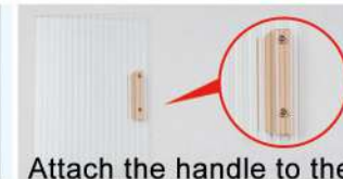
Attach the handle to the door panel with the handle screws