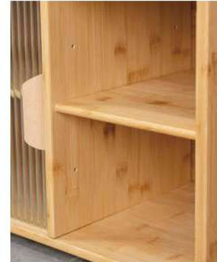
23. Laminate placement is completed as shown