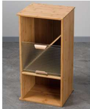
12. Install the left side panel with long screws