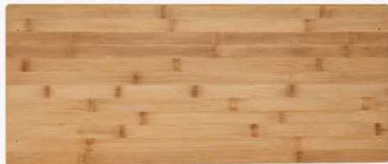
Bracket top panel*1