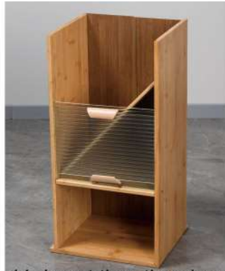
11. Insert the other door panel (note the orientation of the door panel)