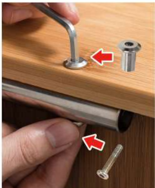
16. Mounting bracket and cabinet with round screw combination