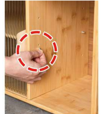
21. Insert the plug in turn (as shown)