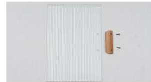
Remove handle screws, door panel and handle