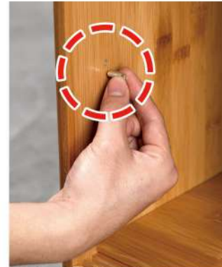
19. Insert the plug in turn (as shown)