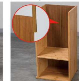
8. Installation of backplane strips and another long backplane