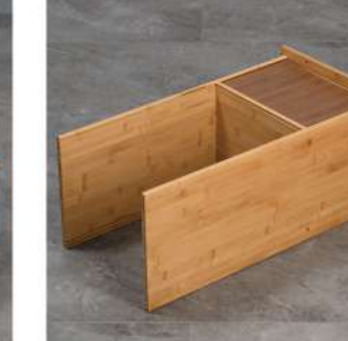
5. Install the top plate with long screws