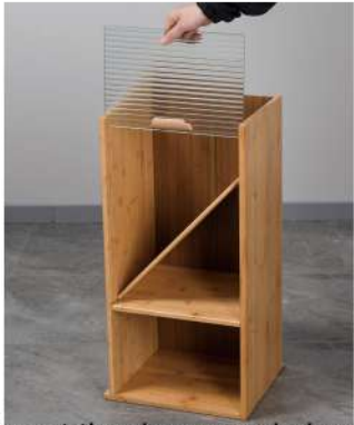
10. Insert the door panel along the groove between the bottom and top panels (note the door panel orientation)