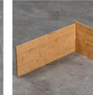
2. Installation with long screws