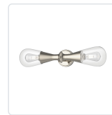
WV361002PN Polished Nickel