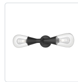
WV361002MB Matte Black