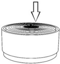
FT-429A (9 lbs) 10.5"W x 2.25"H

Step 8 - Center the top plate (FT-429AA) on the pump house (FT-429B) ensuring that it is level.