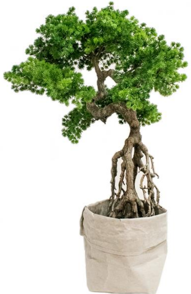
Finished Pine Tree with Paper Eco Planter