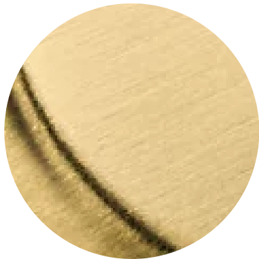
Lifetime (PVD) Satin Brass - 044