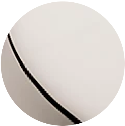
Lifetime (PVD) Polished Nickel - 055