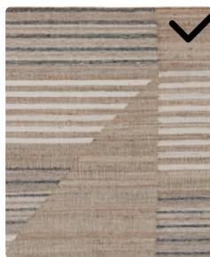
IVNA - IVORY NATURAL