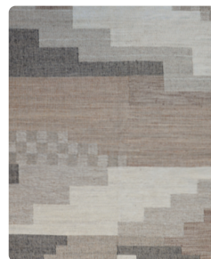
NATU - NATURAL