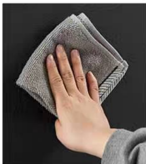
1. Remove wall dust with a towel