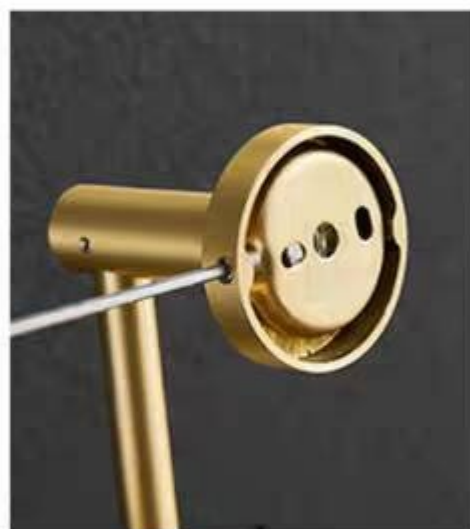
3. Remove the mounting chassis