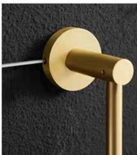
8. Attach the base to the fixed base and tighten screws to secure the product