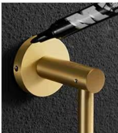
2. After confirming the installation position, mark it with a marker