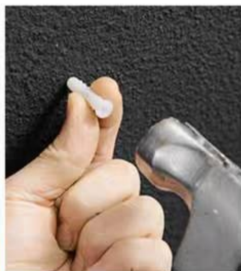
6. Knock in the expansion plastic and cut off the protruding silicone tip with a utility knife