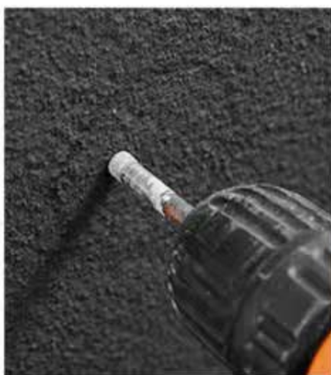
5. Drill holes with an electric drill