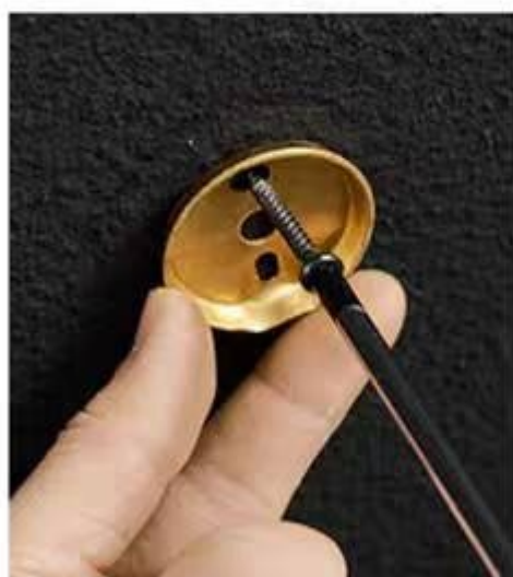
7. Align the holes and tighten the screws securing the chassis