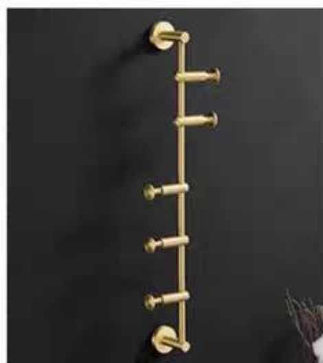
9. The product is installed