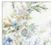
89 Sailor Blue