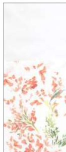
01/69 White/ Indian Corn