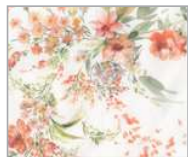
69 Indian Corn

Duvet Cover: Printed on both sides. Knife-edge hem and hidden-button closures Sham are printed on both sides Top sheet and Pillowcases have solid cotton sateen background with printed cuff