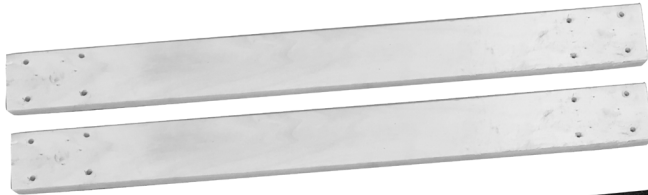
2 Long Pieces