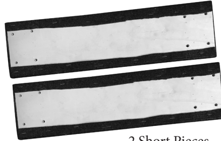
2 Short Pieces