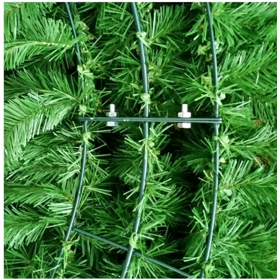
Commercial Grade Frame and PVC Noble Fir