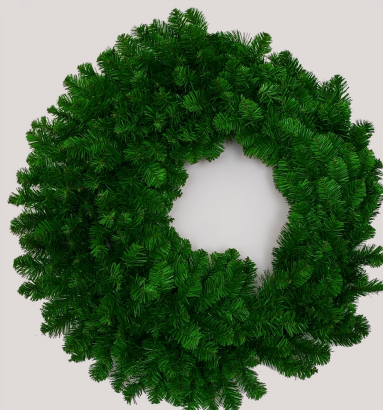
Left half fluffed