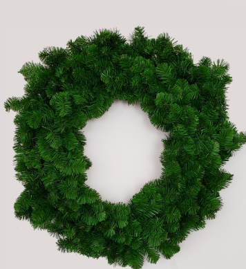
Out of the box