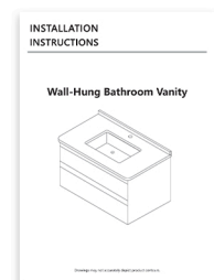
● Instruction Manual