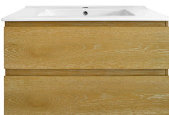
● Wall-Hung Bathroom Vanity