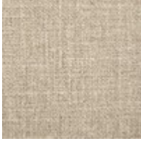
Body Fabric: 2447-34CC