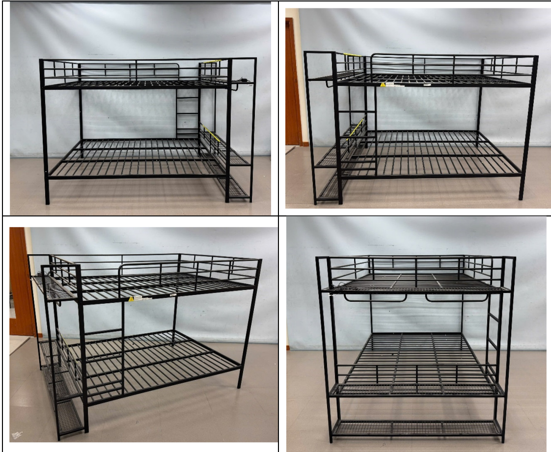
PHOTO OF SUBMITTED SAMPLE FOR TESTING

This document is issued by the Company subject to its General Conditions of Service printed overleaf, available on request or accessible at https://www.sgs.com/en-vn/terms-and-conditions and, for electronic format documents, subject to Terms and Conditions for Electronic Documents at http://www.sgs.com/en/Terms-and-Conditions/Terms-e-Documents.aspx . Attention is drawn to the limitation of liability, indemnification and jurisdiction issues defined therein. Any holder of this document is advised that information contained hereon reflects the Company's findings at the time of its intervention only and within the limits of Client's instructions, if any. The Company's sole responsibility is to its Client and this document does not exonerate parties to a transaction from exercising all their rights and obligations under the transaction documents. This document cannot be reproduced except in full, without prior written approval of the Company. Any unauthorized alteration, forgery or falsification of the content or appearance of this document is unlawful and offenders may be prosecuted to the fullest extent of the law.