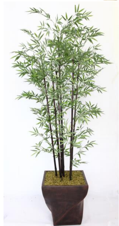
Finished Bamboo Tree