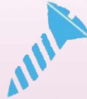
Screws (included in your order)