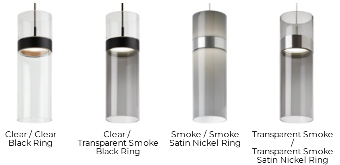
Clear / Clear Black Ring

Includes 18 watt, 925 delivered lumen (725 lumens down/200 lumens up) LED modules. Dimmable with most LED compatible ELV and TRIAC dimmers. Ships with twelve feet of field cuttable cable. Canopy matches finish selection.