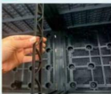
8 Install the reinforcement strips