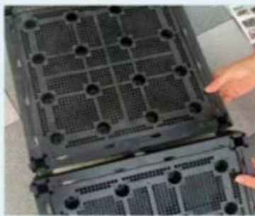
2 Splice the chassis well