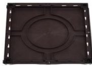
Base Plate x6