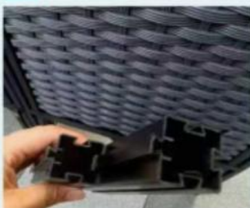
4 Link the two column card slots