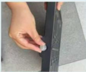
1 Install a waterproof plug on each chassis