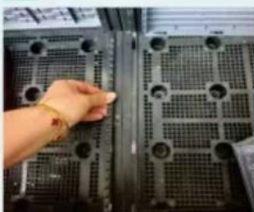
7 Waterproof strips are also installed at the chassis connections