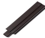
Upright Post x48