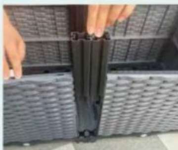
5 Install the columns at once