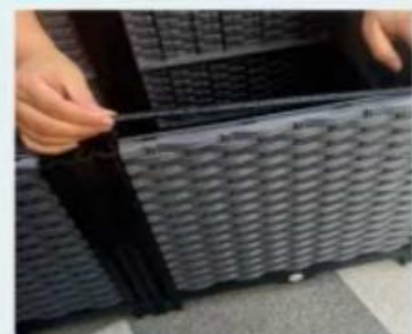
6 Install the waterproofing strips to the side panels in turn