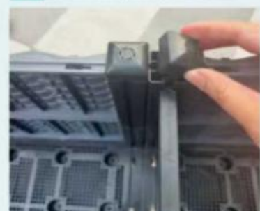
9 Finally, install the black cap

Connect the six flower boxes together in sequence using the aforementioned method.