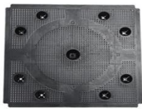
Waterproof Board x6