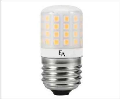
High Quality Dimmable LED Bulb