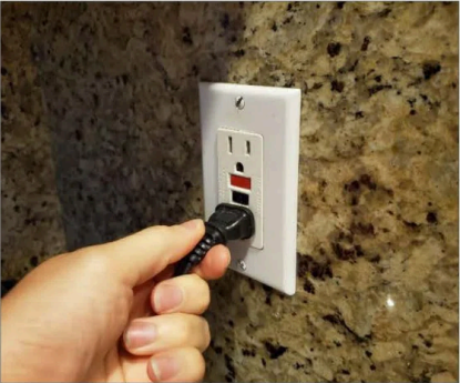
Cord is Intact