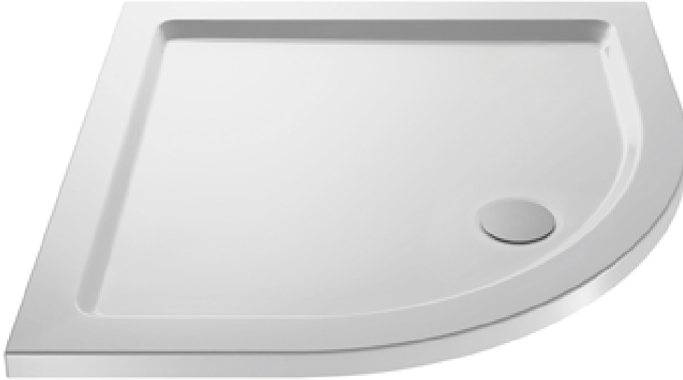
800 x 800 QUADRANT TRAY