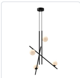
CH89832-BK/GO Black/Glossy Opal Glass

* For custom options, consult factory for details.