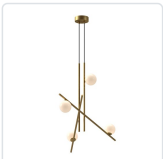
CH89832-BG/GO Brushed Gold/Glossy Opal Glass