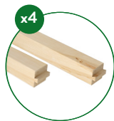
Floor Support Blocks (2) long (2) short