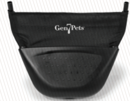
Front Wheel Assembly