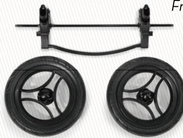
Rear Wheels and Axle