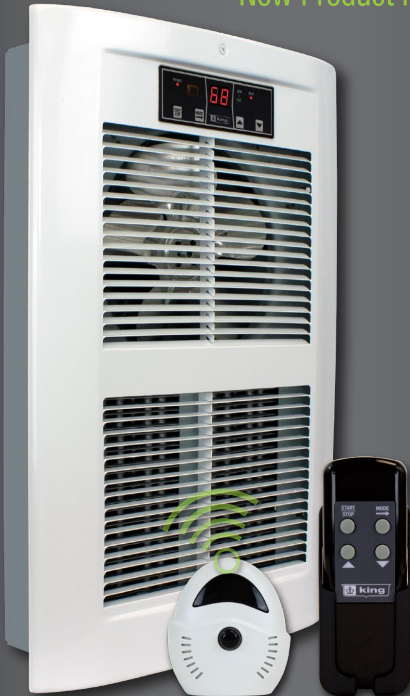
EC02S Temperature Sensor