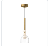
PD30505-BG/CL Brushed Gold/Clear