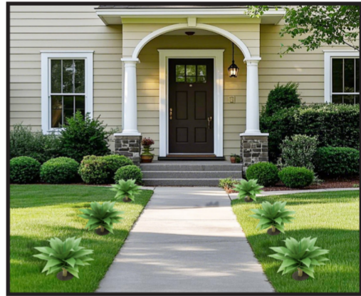
Step 4: It can be easily installed in soil or decorative flower pots.