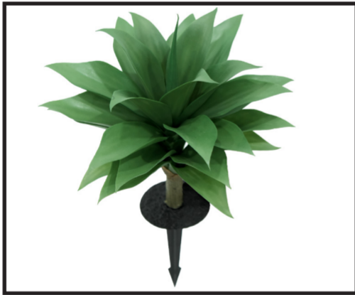
Step 3: Adjust the blade angle to make the leaf shape stretched and natural. ( Warning: Due to blade height simulation, sharp edges, be careful of cuts. )