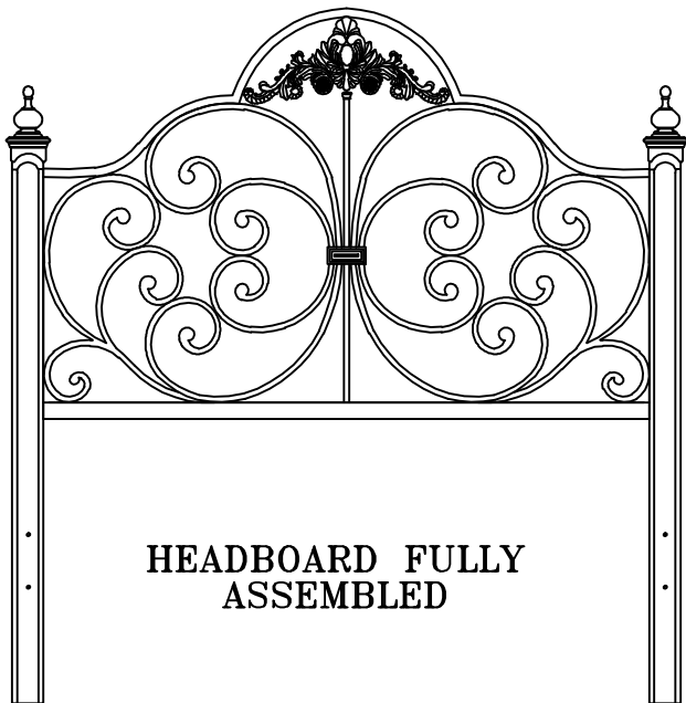
HEADBOARD FULLY ASSEMBLED

SAVE ALL PACKAGING MATERIALS UNTIL PRODUCT IS FULLY ASSEMBLED. HARDWARE AND SMALL PIECES MAY NOT BE SEEN AND BE ACCIDENTALLY DISCARDED WITH PACKAGING MATERIALS.