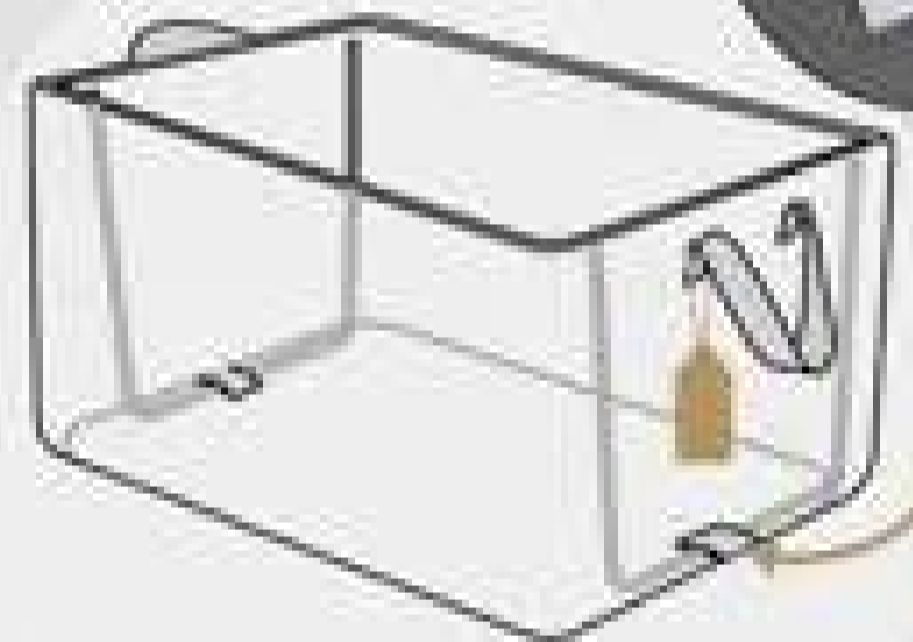
3 Expand to 90° for Secure Lock