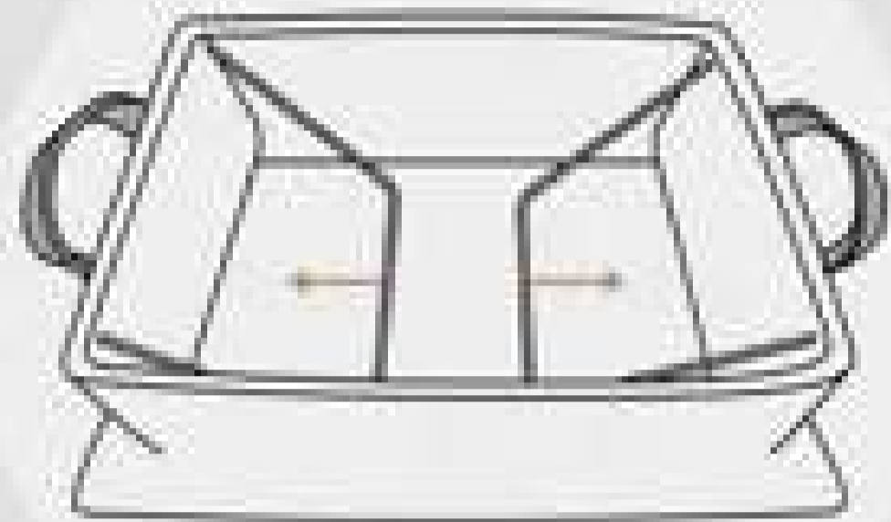
2 Push inward firmly