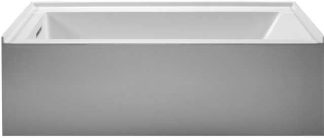
Features integral skirting and tile flange.