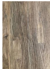
Blocking or stamps to replace holes left by hardware