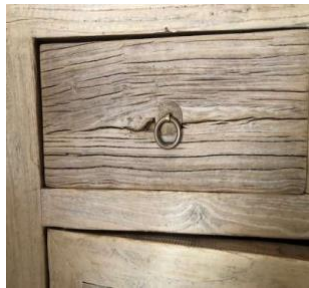
Small cracks along grain lines