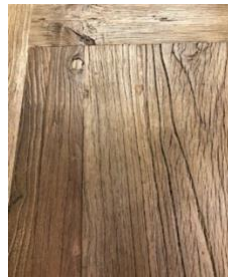
Small areas of natural surface variations