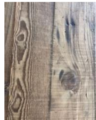
Knots in grain.