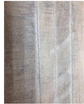
Small cracks due to seasonal temperature and humidity variations