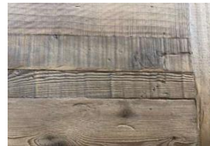
Grain pattern variation

**Slight color variations in overall color is also a natural characteristic as each piece accepts stain differently.