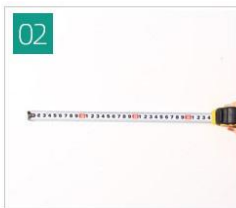
02 Make a horizontal line on the wall and mark it according to the measured distance