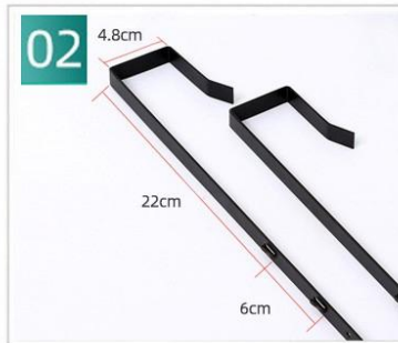
02 Measure the thickness of the door to be less than or equal to 4.8cm