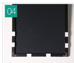
04 Stick adhesive on the lower half of the back of the mirror