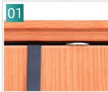
01 Measure the gap between the doors to fit a coin