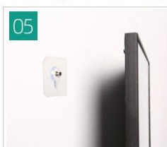
05 Align the hanging hole and hang it on the wall