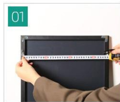
01 Measure the distance between two hanging holes (based on the center point of the hanging hole)