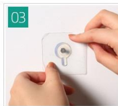
03 Tear off the isolation paper for the hanging piece, align it with the center point of the hanging piece according to the mark, and paste it until there are no bubbles on the hanging piece