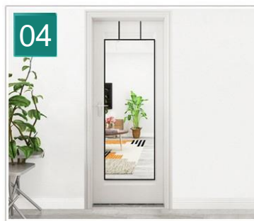
04 Just hang the door