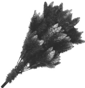
Ⓐ BOTTOM SECTION OF TREE