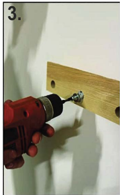
3. Secure the screws tight into the hole drilled in the wall with the help of drill