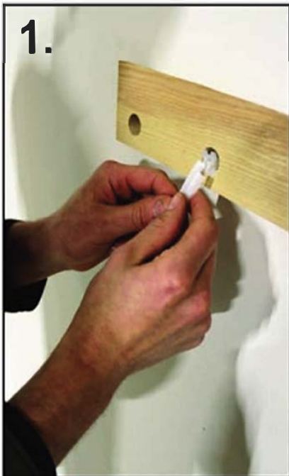
1. Insert the plastic dry wall anchor inside the hole drilled into the wall through the wooden support