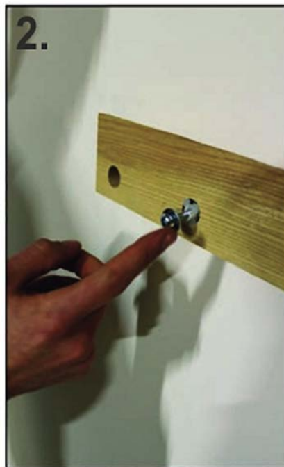
2. Thread the metal screw through the plastic washer until it threads till the wall