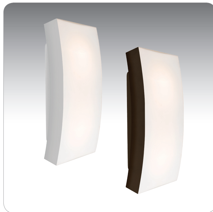
SHOWN IN OPAL MATTE/SILVER AND OPAL MATTE/BRONZE

UL or ETL Listed. Suitable for Wet Locations (interior or exterior use).