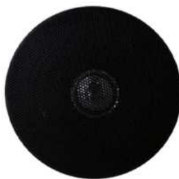
Bluetooth * :BT SPEAKER