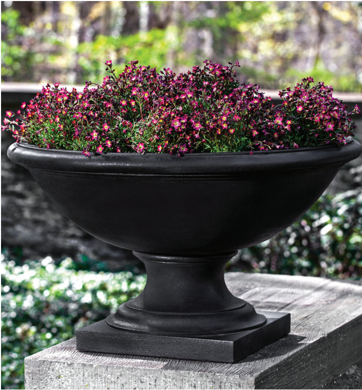
Shown in Nero Nuovo