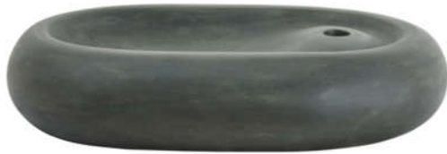
faucet not included

W: 23- \frac{1}{2} " D: 15- \frac{1}{2} " H: 4- \frac{3}{4} "