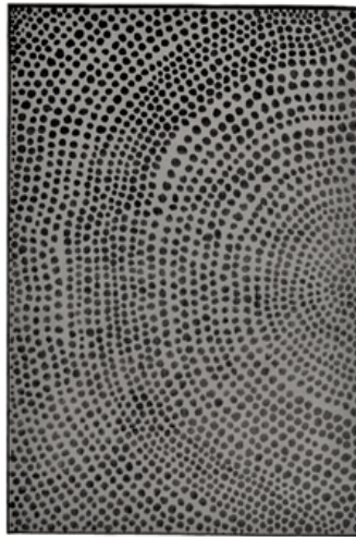
CASTLE / DARK GRAY