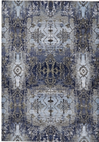
LIGHT BLUE / STERLING