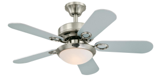
Reversible Silver Finish Blades