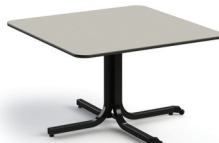
BFL-4-(42x42) 4-Person Adjustable Table