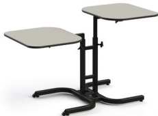
BFL-2-(1/1) 2-Person Adjustable Table