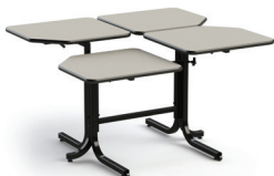
BFL-4-(2/2) 4-Person Adjustable Table