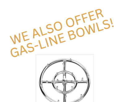
COMPATIBLE WITH ANY FIRE BOWL