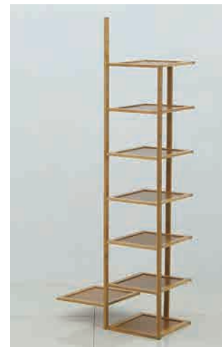
④ Position Panel (c) on the Long Pillar (b) as picture shown. Secure it with Screw (d).

© 2020 - 2021 by Pundarika LLC - MoNiBloom.com