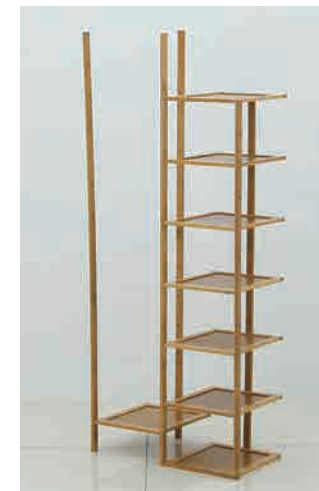
⑤ Install the rest Long Pillars on the side of the installed Panel from Step 4.