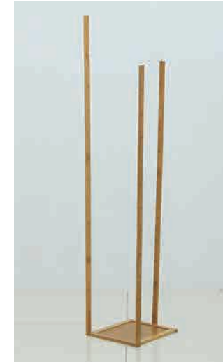
② Install Long Pillar (b) with Screw (c) as picture shown.