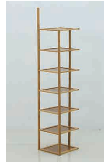
③ Position and secure Panels (c) with Screws (d) one by one as picture shown.

© 2020 - 2021 by Pundarika LLC - MoNiBloom.com