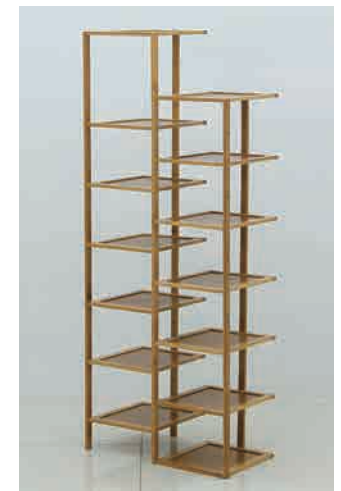
⑥ Install the rest Panels (c) as picture shown.