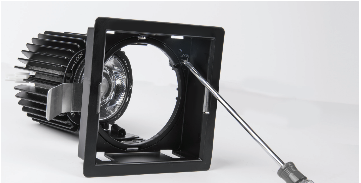
365° horizontal lockable hot aiming