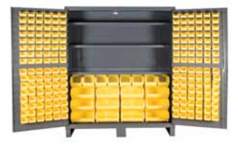
Heavy Duty Bin Cabinets