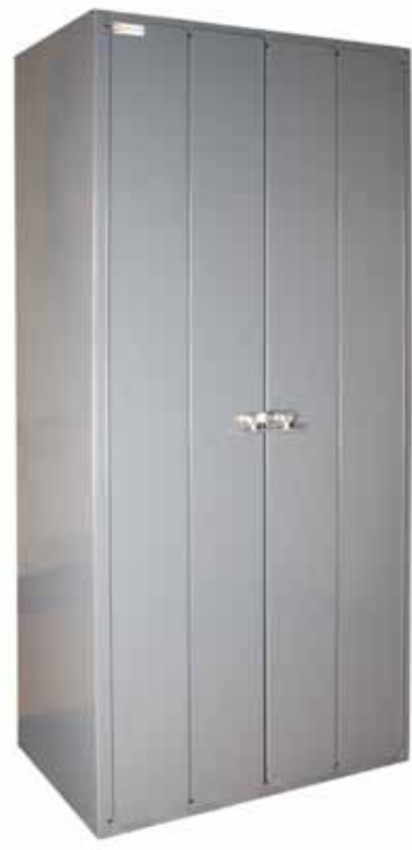
Shown in closed position