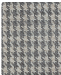
CP02 - GREY